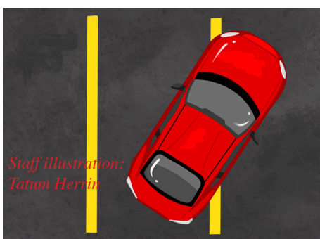
Staff illustration: Tatum Herrin

Selected Student Profile with Menlo Learn to Park Anonymous, pg 5