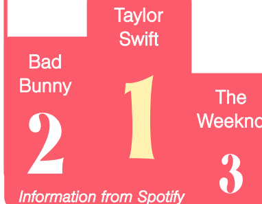
Information from Spotify